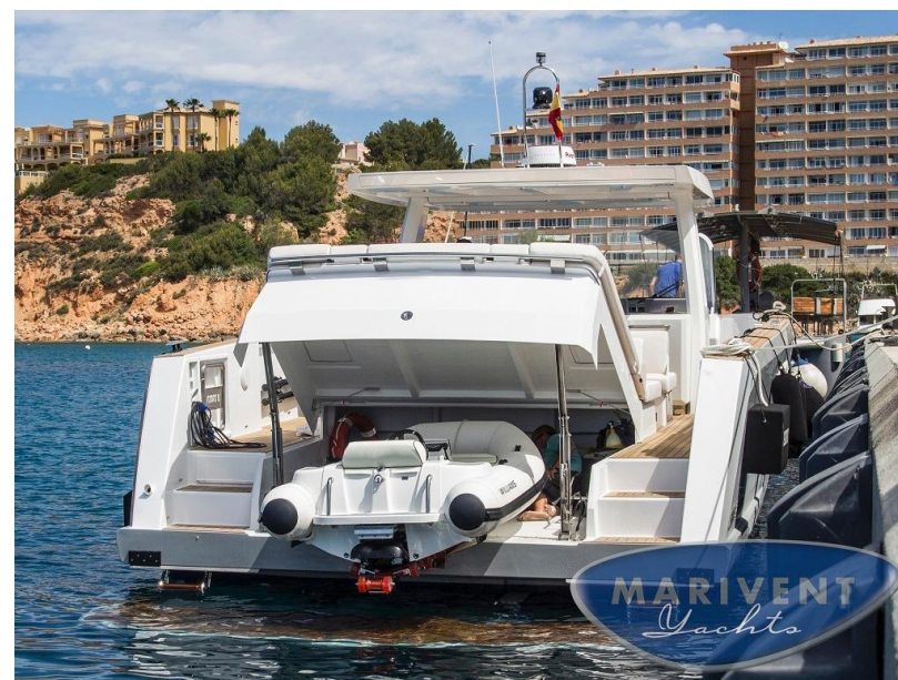
FJORD 52 open main deck - option