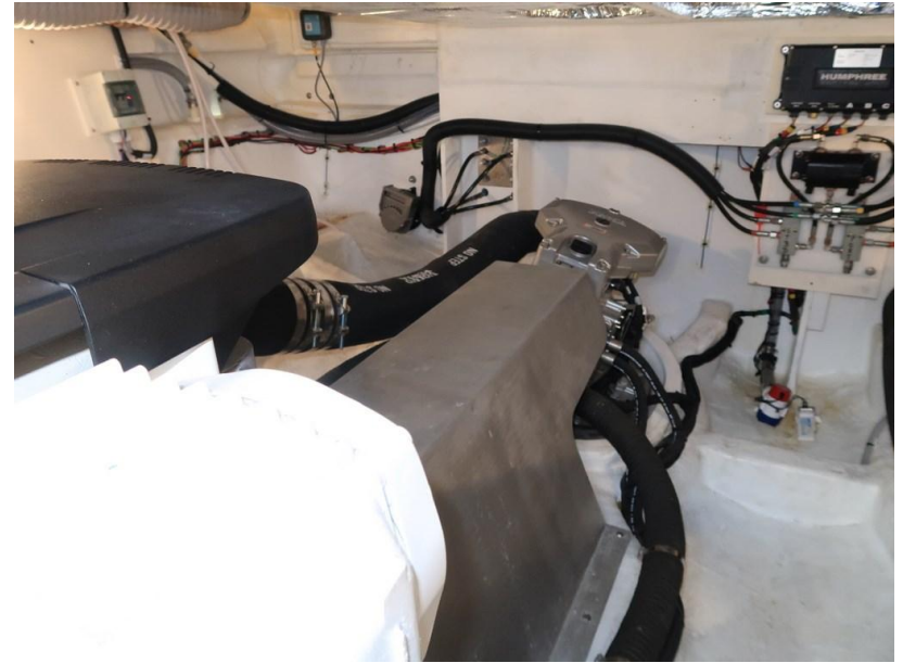
EXTERIOR + INTERIOR LAYOUTS