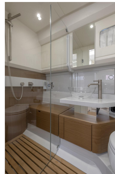
BG42 | 1 cabin, 1 bathroom -STD