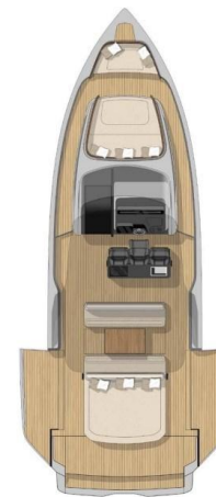
MAIN DECK FOLD-DOWN BULWARKS