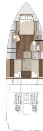
LOWER DECK RIGHT