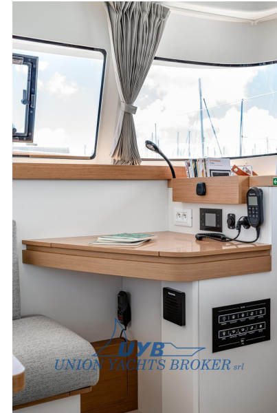
Excess 11 - Mention obligatoire/Mandatory credit: Photo Nicolas Claris