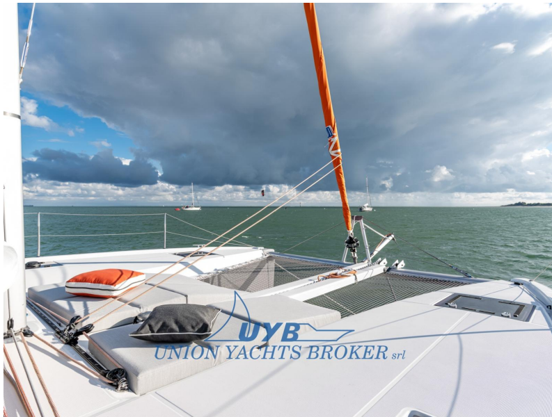
Excess 11