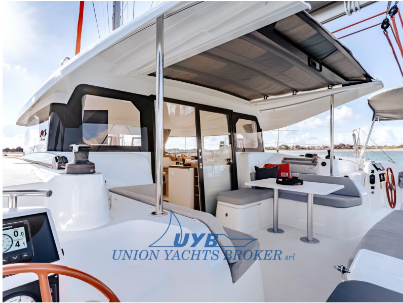
Excess 11