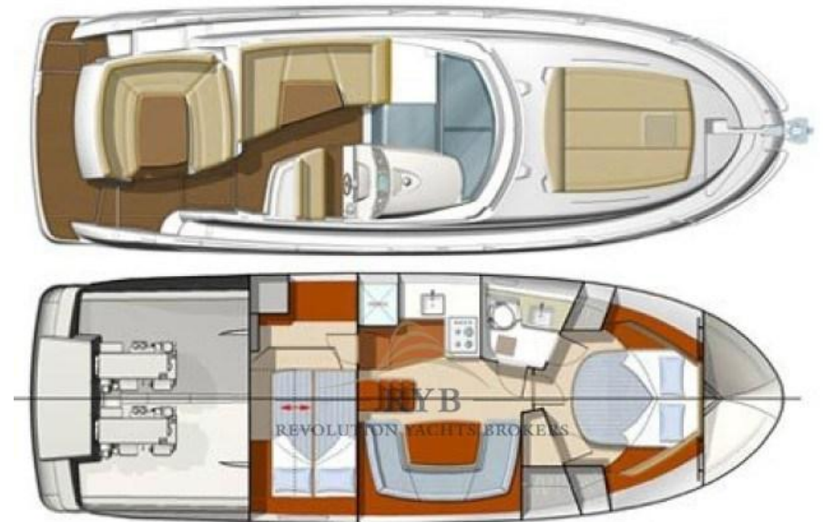
Garroni Designers - JEANNEAU Prestige 38 s - octobre 2007