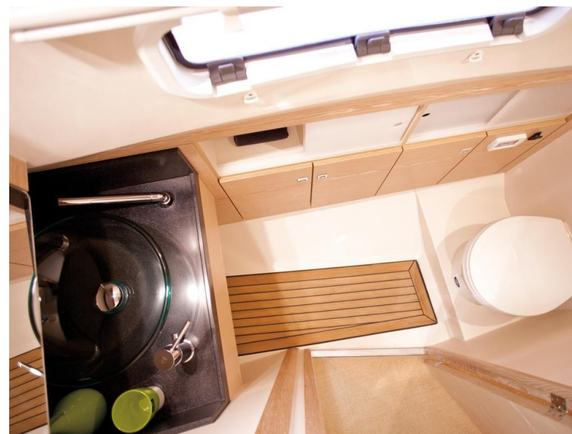
EXTERIOR + INTERIOR LAYOUTS