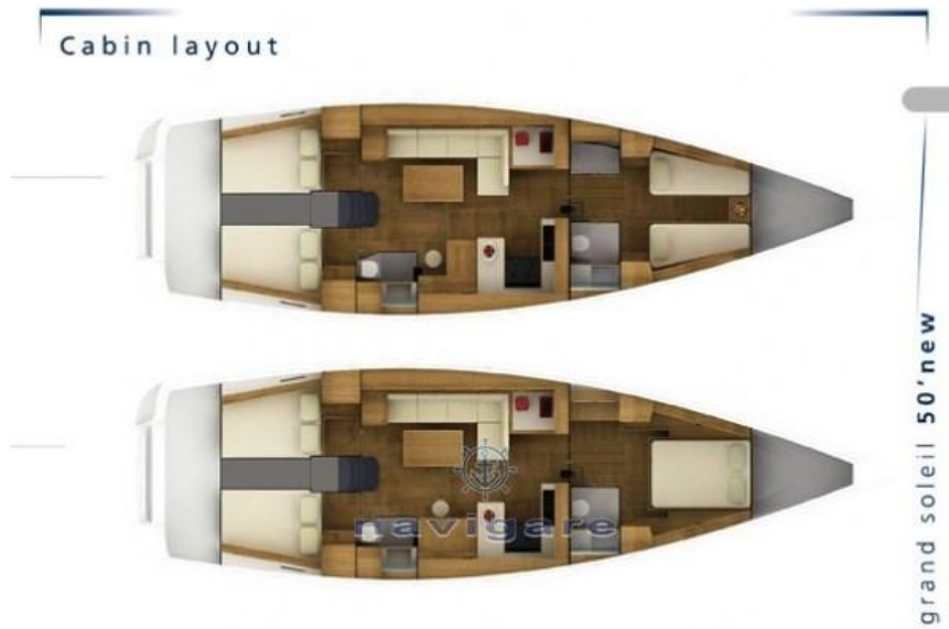
grand soleil 50'new