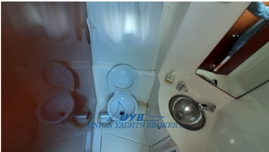
Garroni Designers - JEANNEAU Prestige 32 Fly - 2006