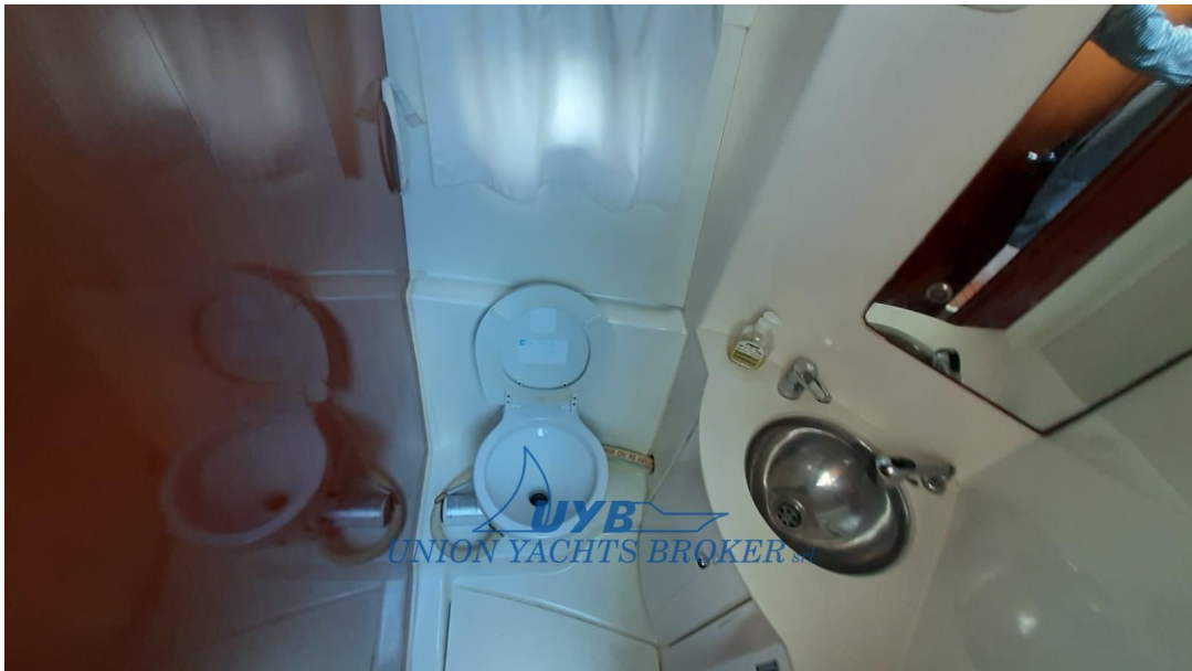
Garroni Designers - JEANNEAU Prestige 32 Fly - 2006