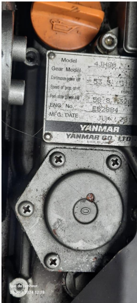
que du bonheur. 26 août 2024 12:28