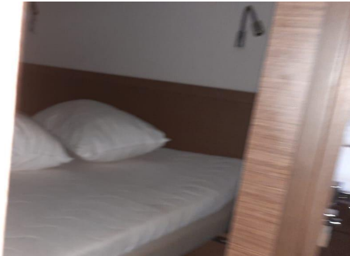
que du bonheur. 26 août 2024 12:22