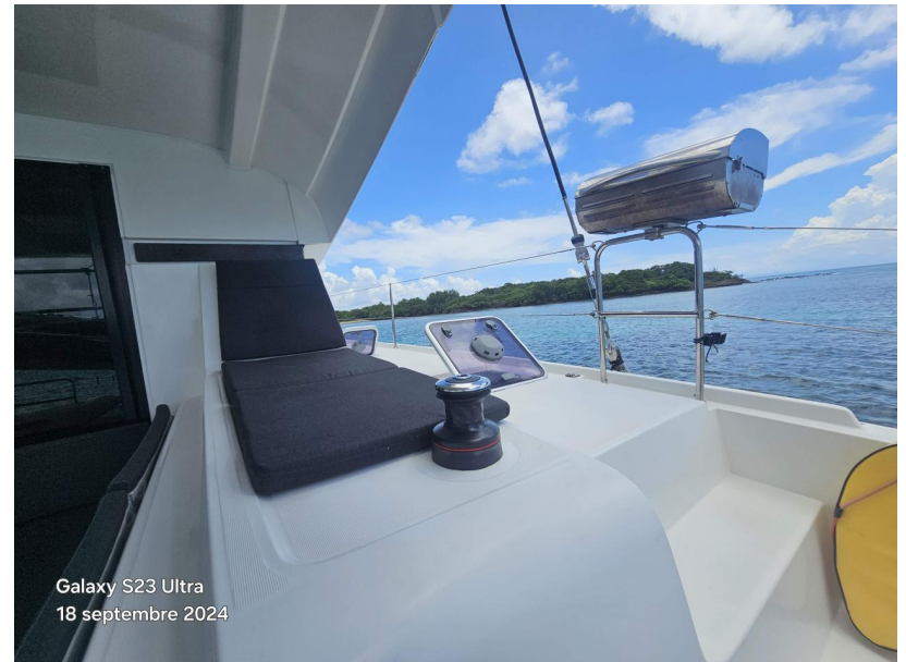
Galaxy S23 Ultra 18 septembre 2024