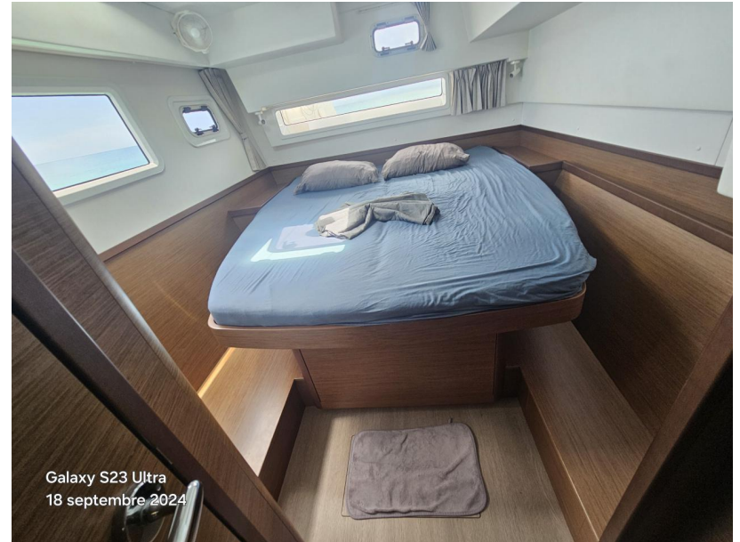
Galaxy S23 Ultra 18 septembre 2024