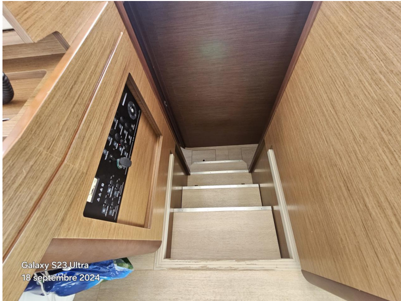
Galaxy S23 Ultra 18 septembre 2024