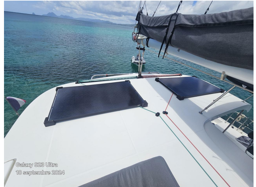
Galaxy S23 Ultra 18 septembre 2024