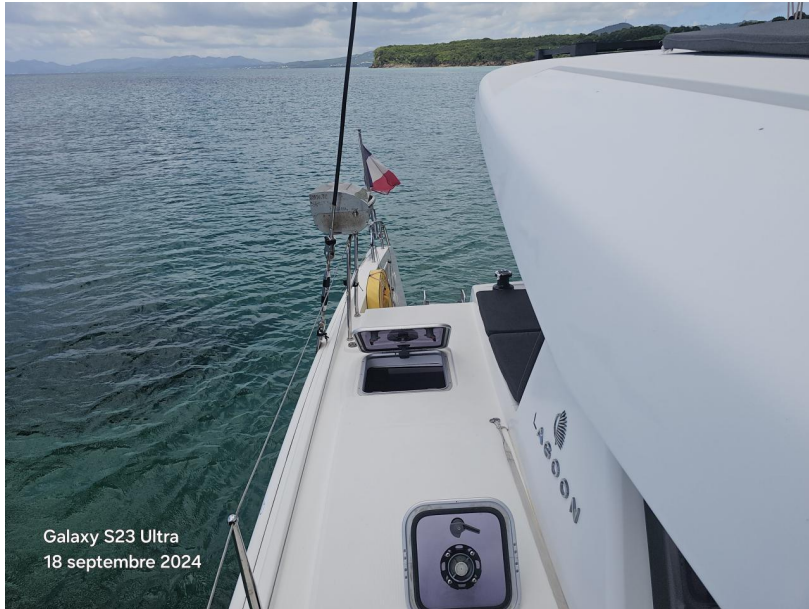
Galaxy S23 Ultra 18 septembre 2024