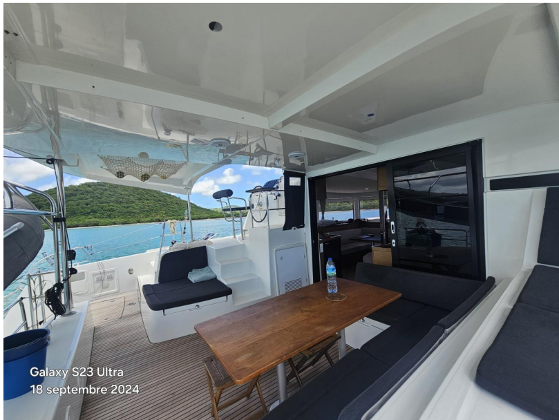
Galaxy S23 Ultra 18 septembre 2024