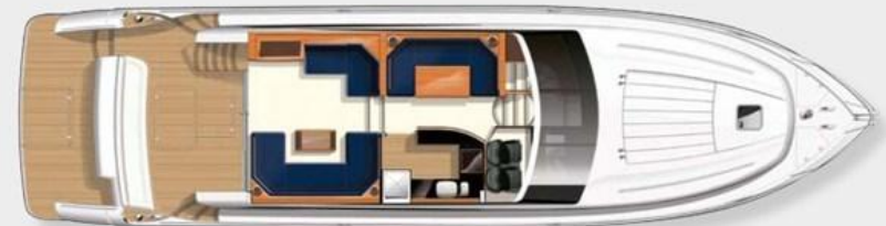
Upper accommodation layout