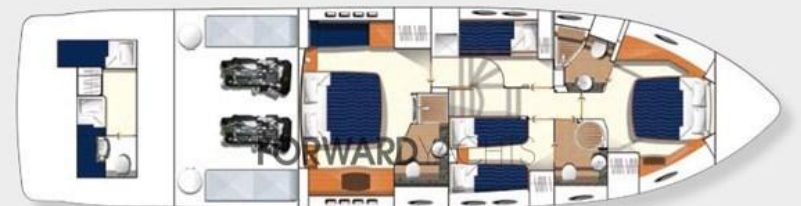
Lower accommodation layout