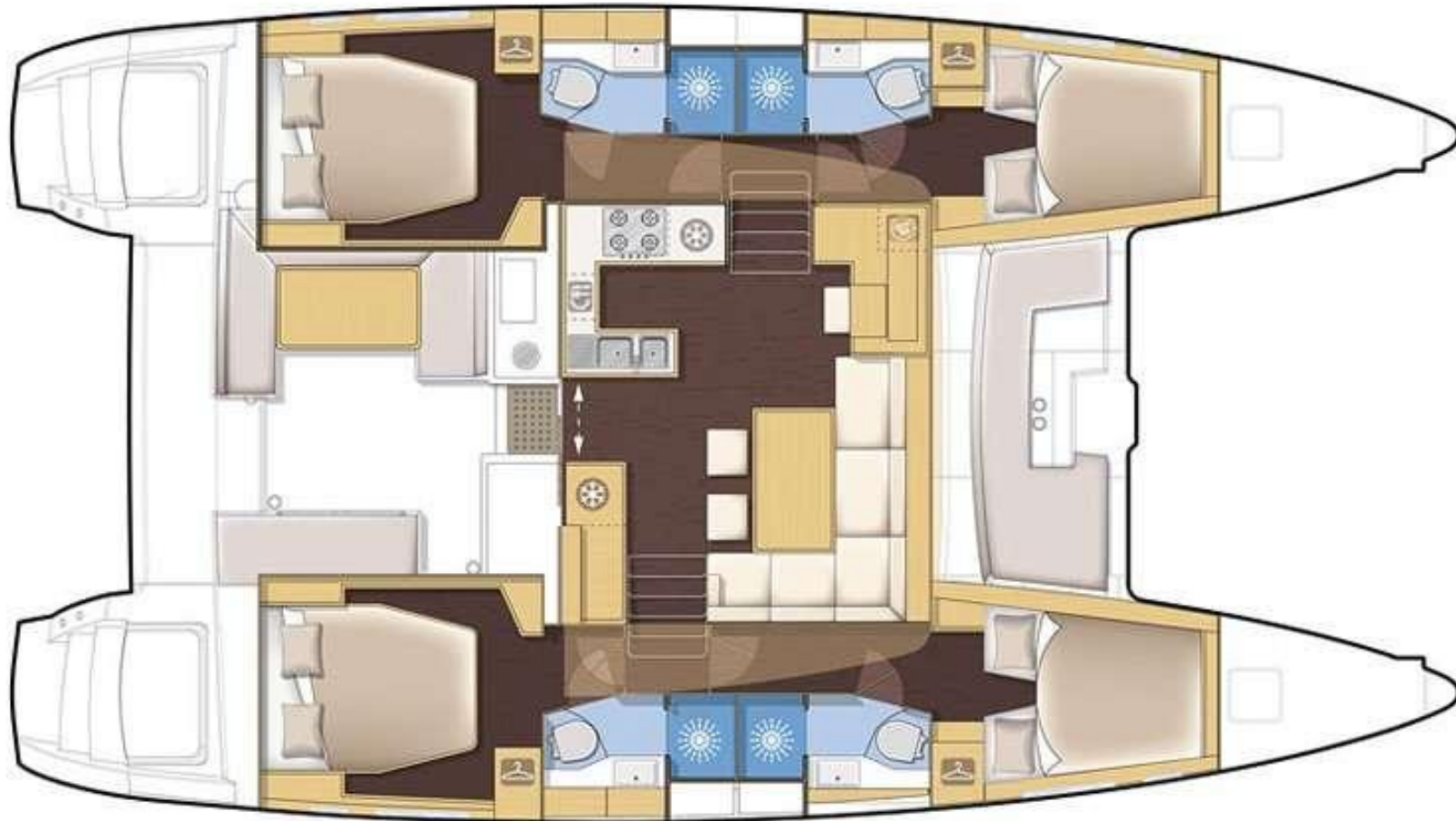
version 4 cabines / 4 cabins version