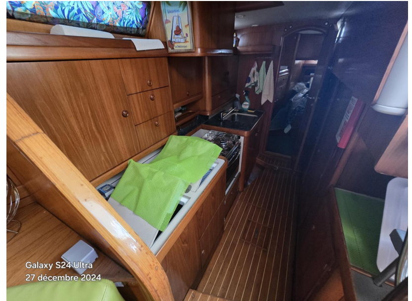
Galaxy S24 Ultra 27 décembre 2024