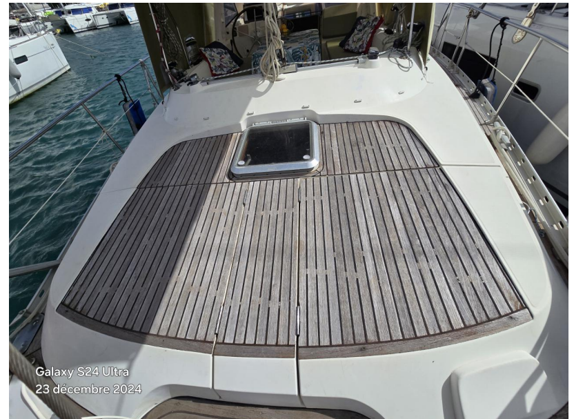
Galaxy S24 Ultra 23 décembre 2024