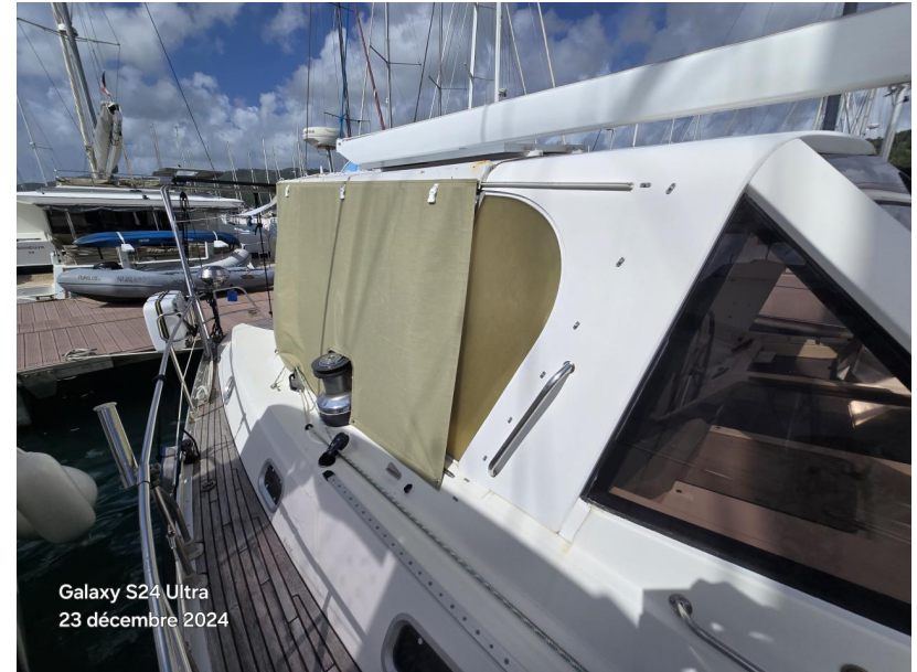
Galaxy S24 Ultra 23 décembre 2024