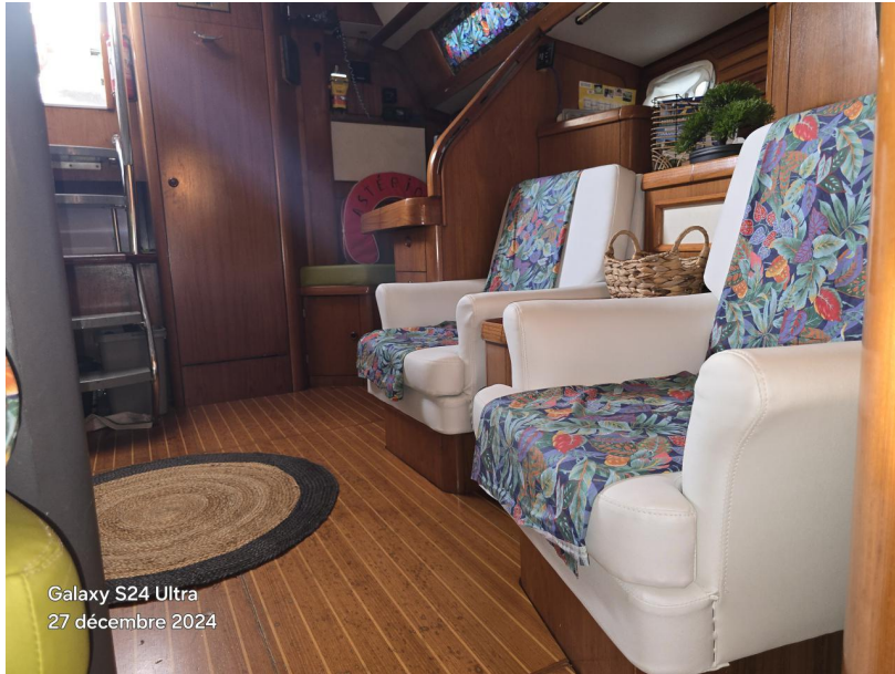
Galaxy S24 Ultra 27 décembre 2024