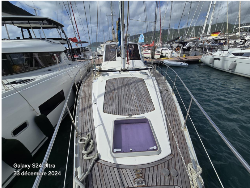
Galaxy S24 Ultra 23 décembre 2024