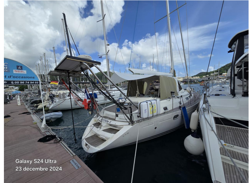
Galaxy S24 Ultra 23 décembre 2024