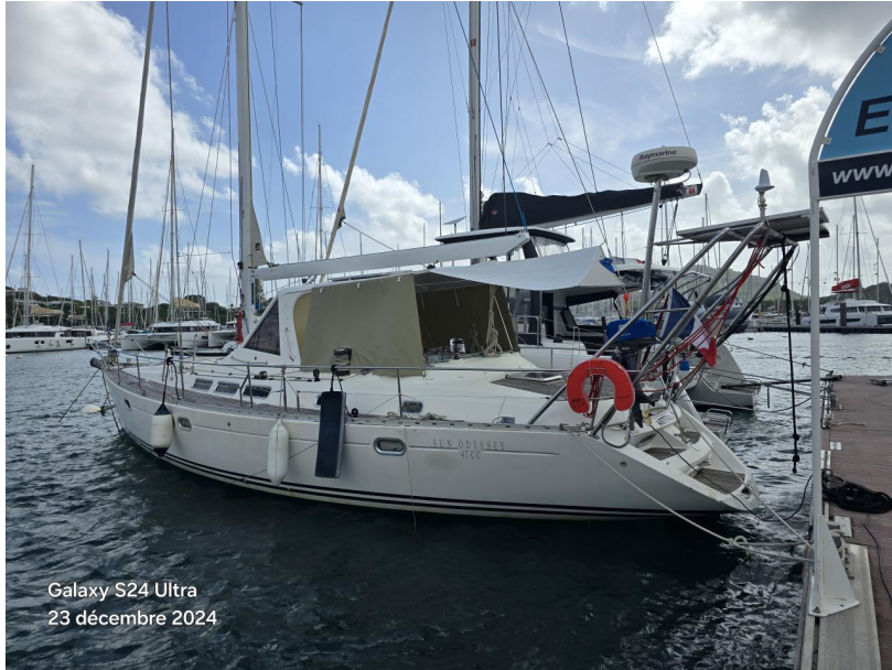
Galaxy S24 Ultra 23 décembre 2024