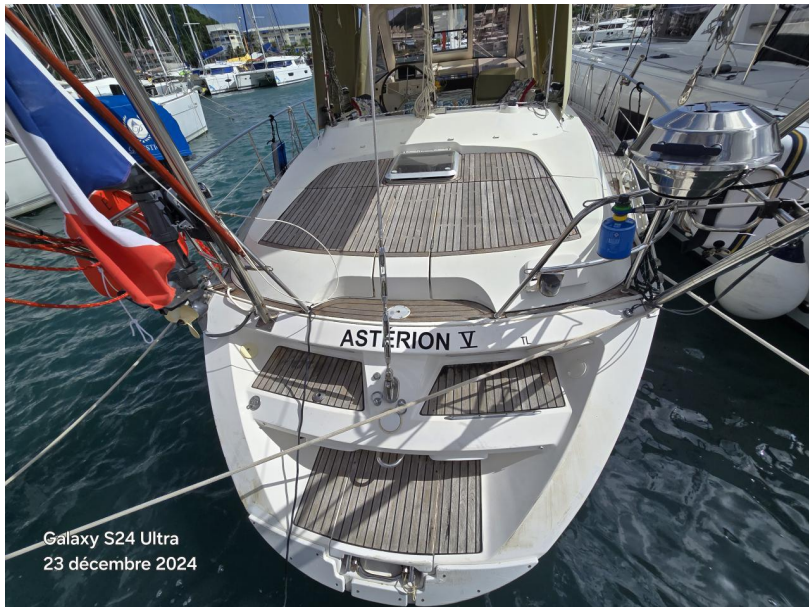
Galaxy S24 Ultra 23 décembre 2024