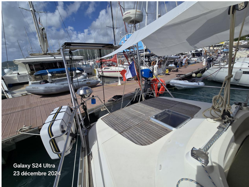
Galaxy S24 Ultra 23 décembre 2024