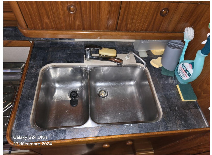
Galaxy S24 Ultra 27 décembre 2024