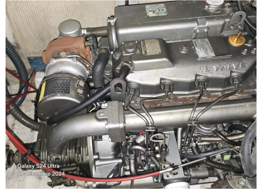
Galaxy S24 Ultra 27 décembre 2024