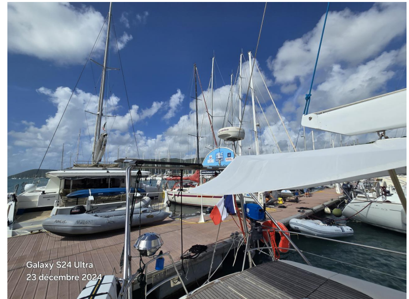
Galaxy S24 Ultra 23 décembre 2024