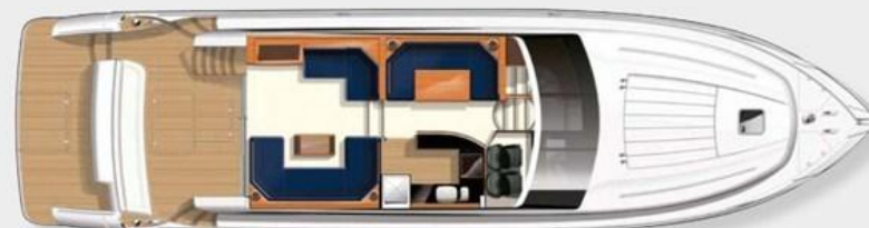
Upper accommodation layout