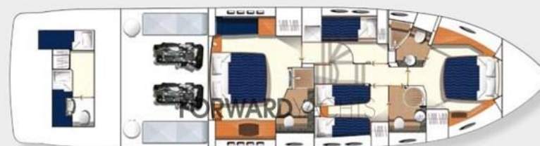
Lower accommodation layout