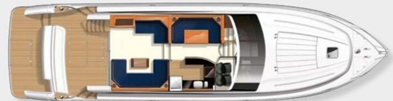
Upper accommodation layout