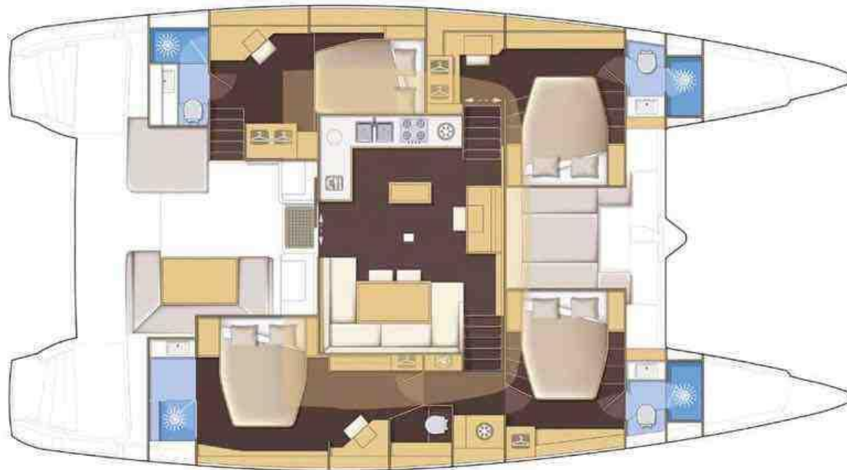
Lagoon 52 version 4 cabines - 4 cabins version