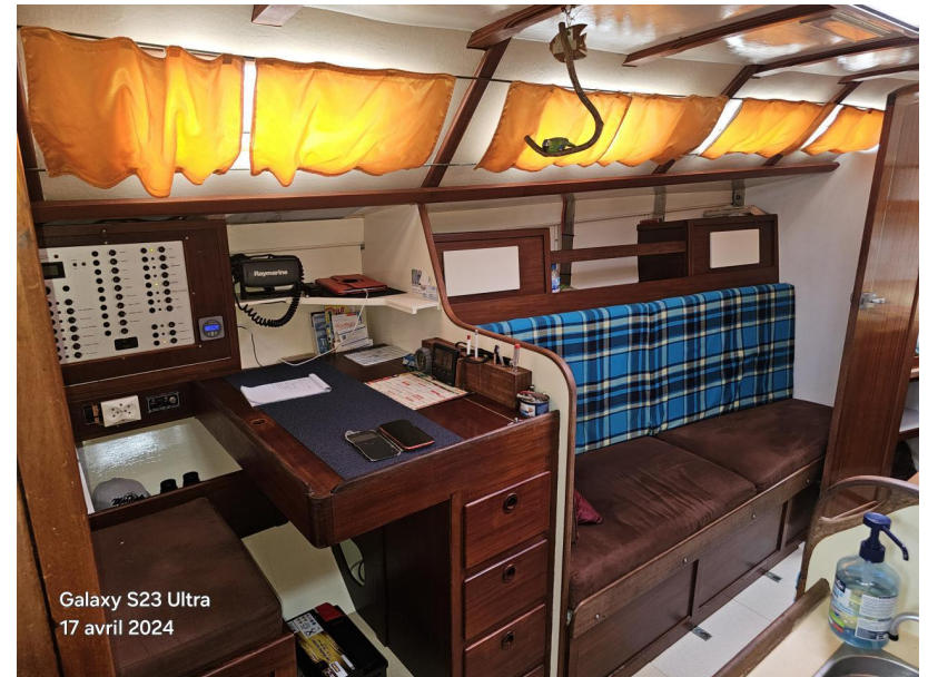
Galaxy S23 Ultra 17 avril 2024