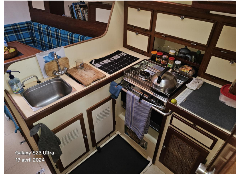
Galaxy S23 Ultra 17 avril 2024