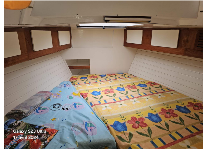
Galaxy S23 Ultra 17 avril 2024