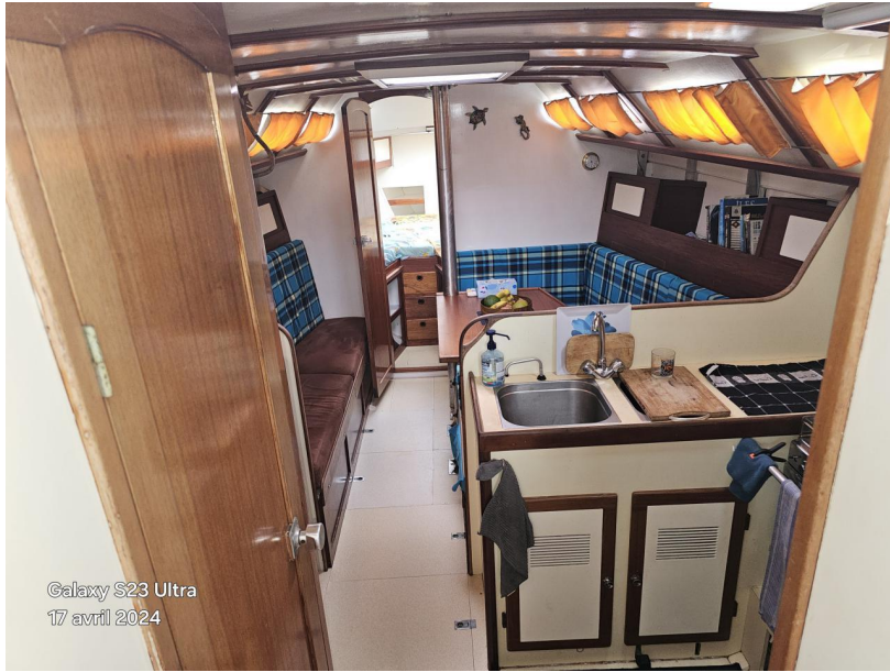
Galaxy S23 Ultra 17 avril 2024