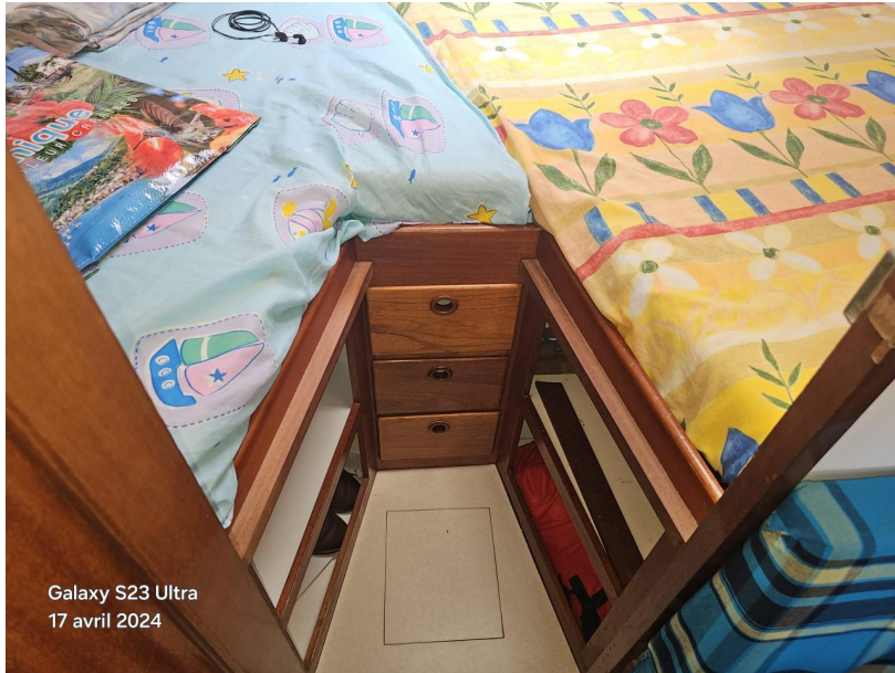
Galaxy S23 Ultra 17 avril 2024