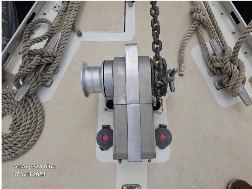
Galaxy S23 Ultra 17 avril 2024