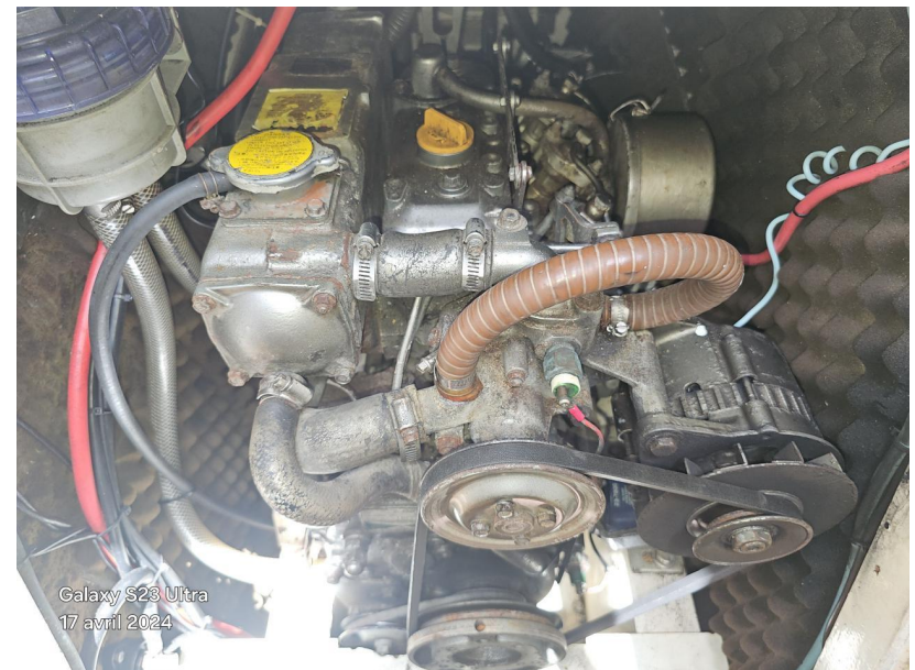
Galaxy S23 Ultra 17 avril 2024