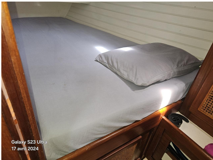
Galaxy S23 Ultra 17 avril 2024