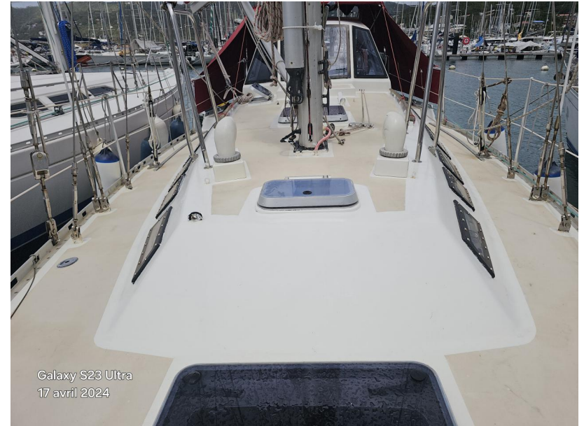
Galaxy S23 Ultra 17 avril 2024