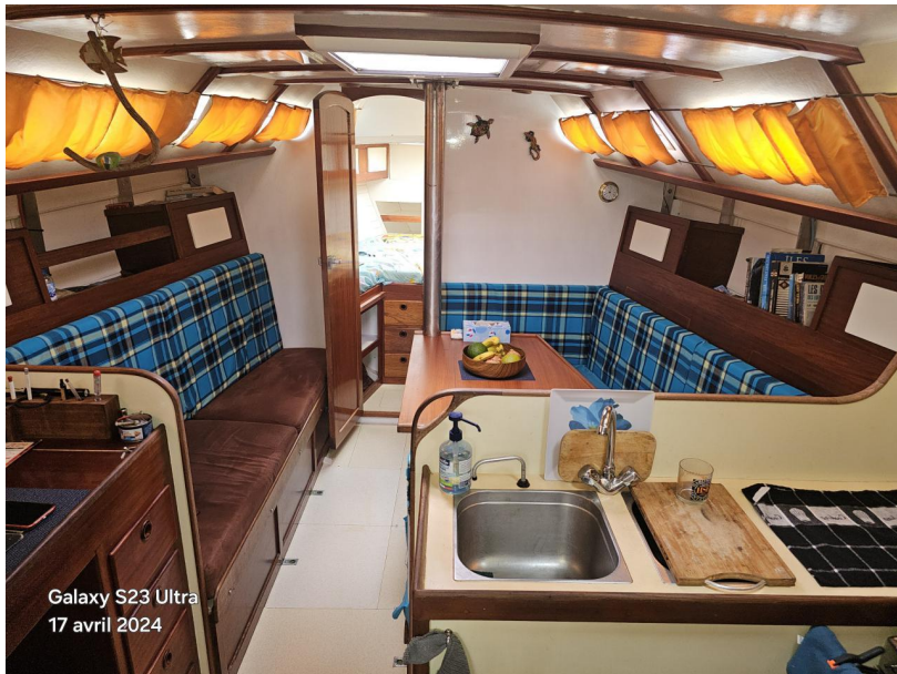
Galaxy S23 Ultra 17 avril 2024