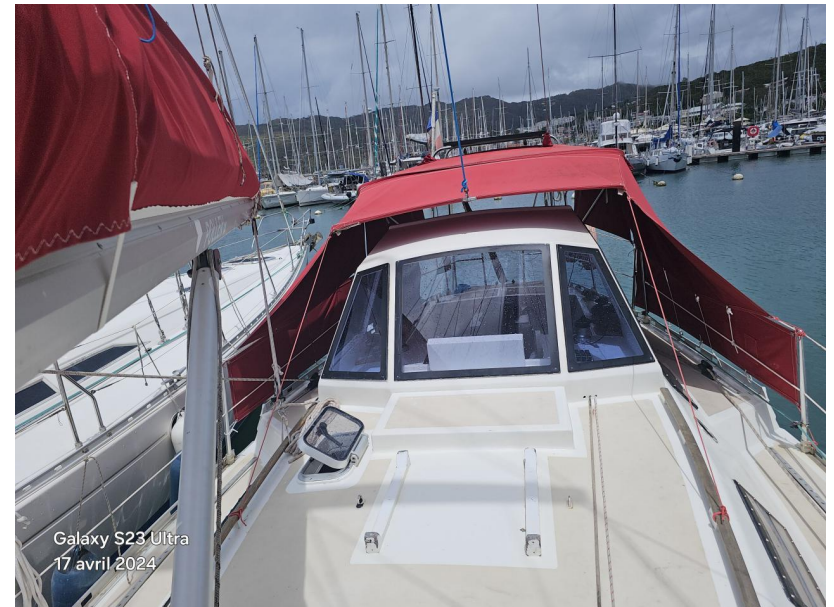
Galaxy S23 Ultra 17 avril 2024