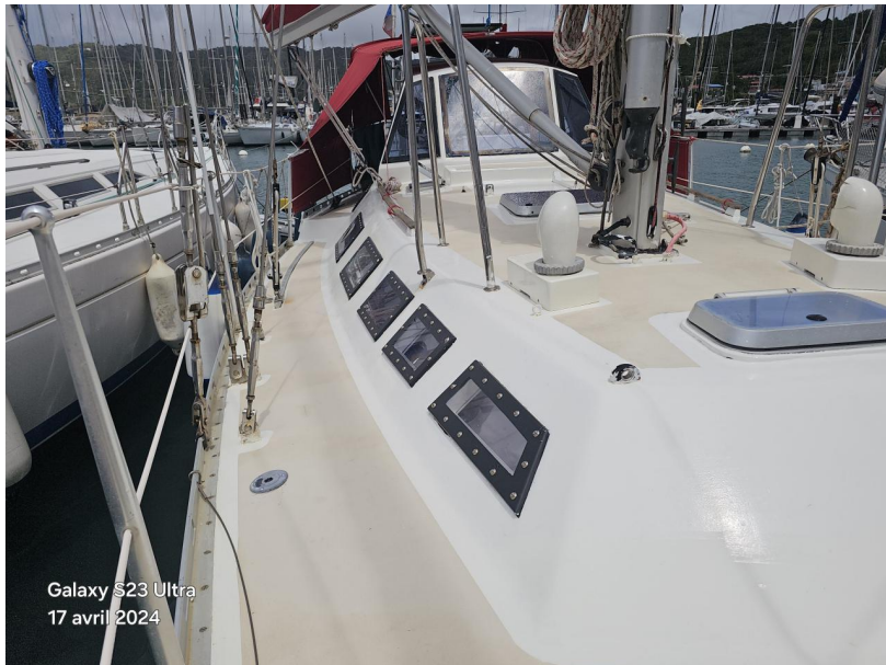
Galaxy S23 Ultra 17 avril 2024