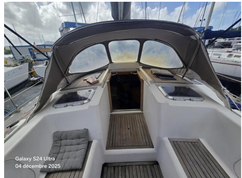
Galaxy S24 Ultra 04 décembre 2025