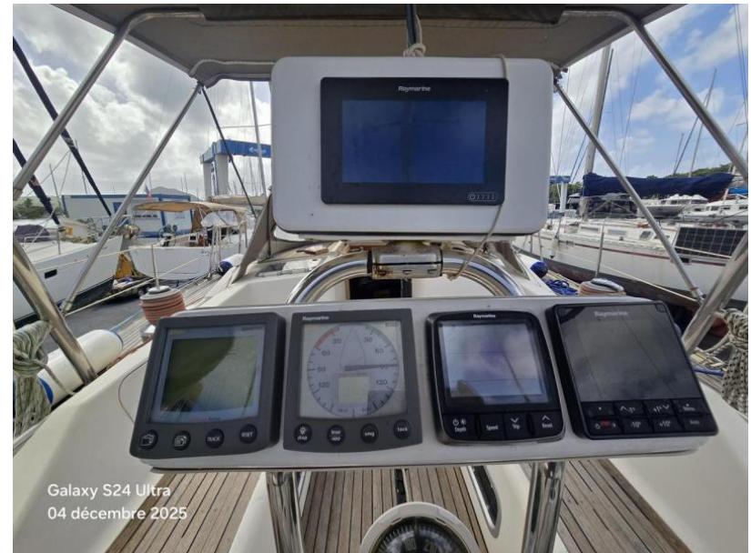
Galaxy S24 Ultra 04 décembre 2025