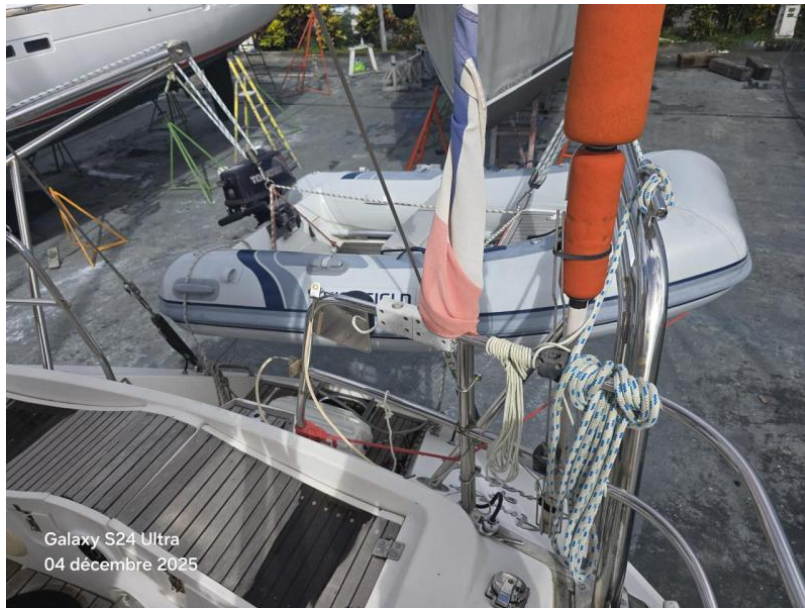
Galaxy S24 Ultra 04 décembre 2025