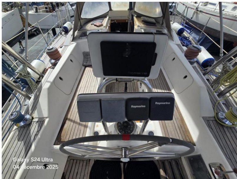
Galaxy S24 Ultra 04 décembre 2025