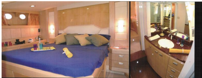
OWNER'S CABIN / CABINA ARMATORIALE