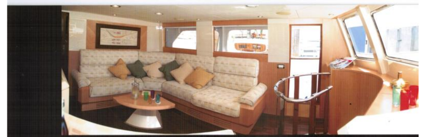
MAIN SALOON / SALONE PRINCIPALE DI PRUA