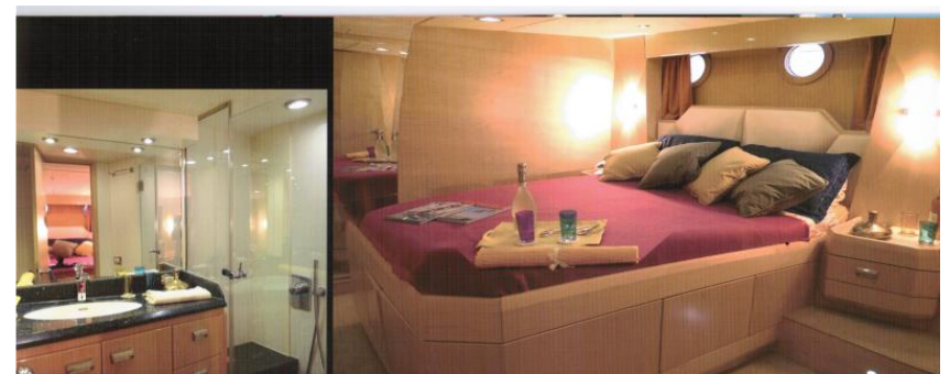
VIP CABIN / CABINA VIP