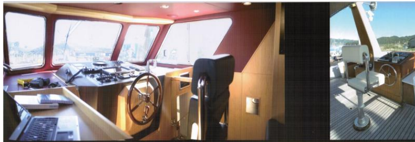
WHEELHOUSE / PLANCIA DI COMANDO