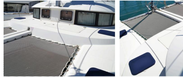
Lagoon 38 BAFAH