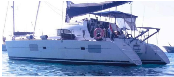
Lagoon 38 BAFAH