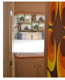
Lagoon 38 BAFAH