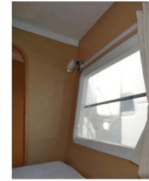
Lagoon 38 BAFAH