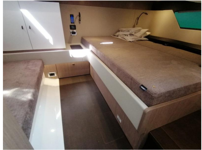
LOWER DECK - STANDA