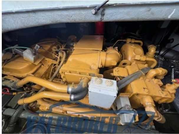
RAFFAELLI STORM S – REFITTING 2024