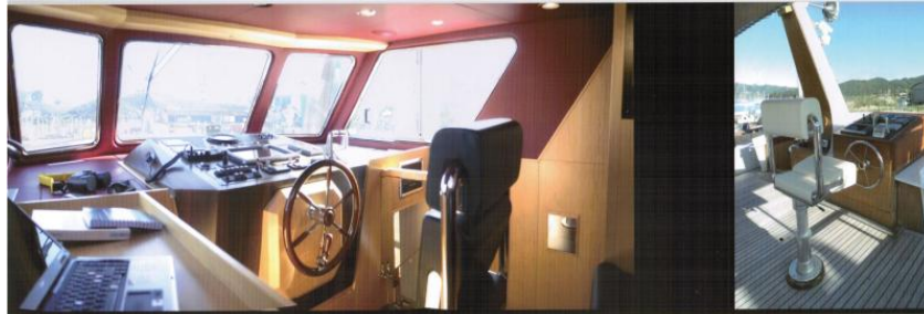
WHEELHOUSE / PLANCIA DI COMANDO