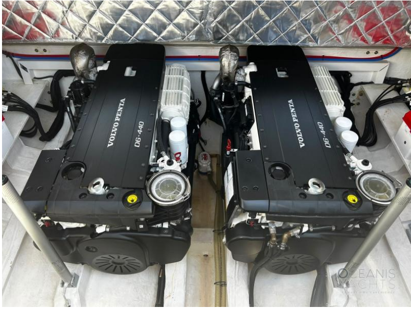
Lower deck INBOARD