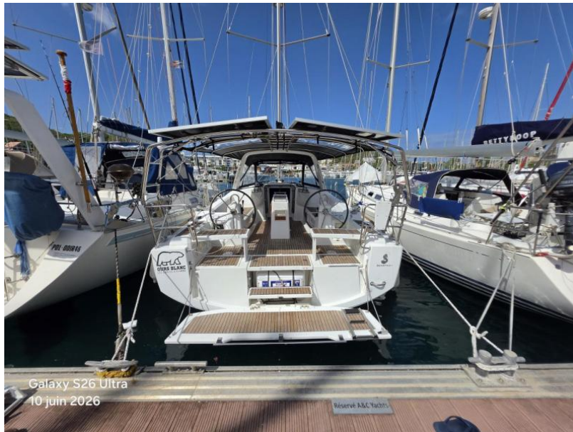
Galaxy S26 Ultra 10 juin 2026