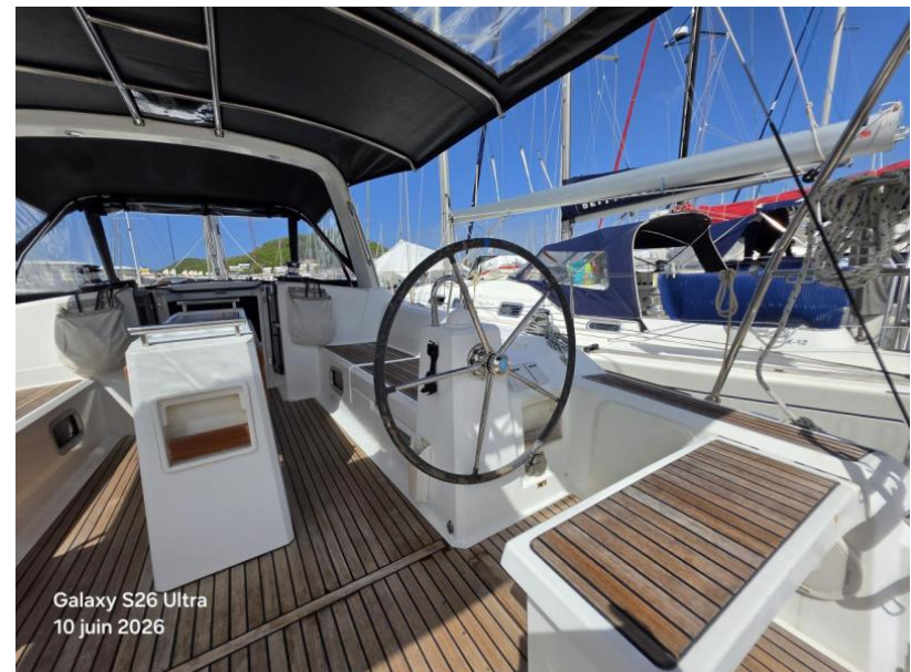
Galaxy S26 Ultra 10 juin 2026