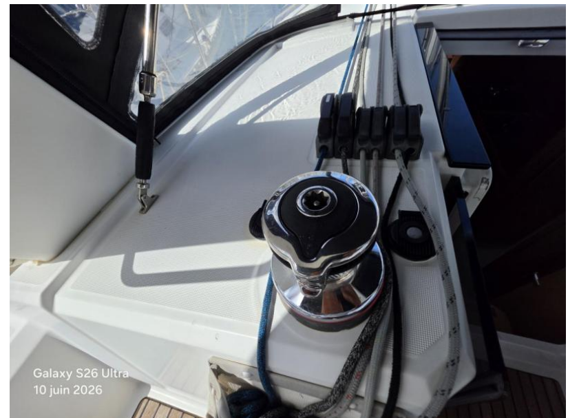
Galaxy S26 Ultra 10 juin 2026