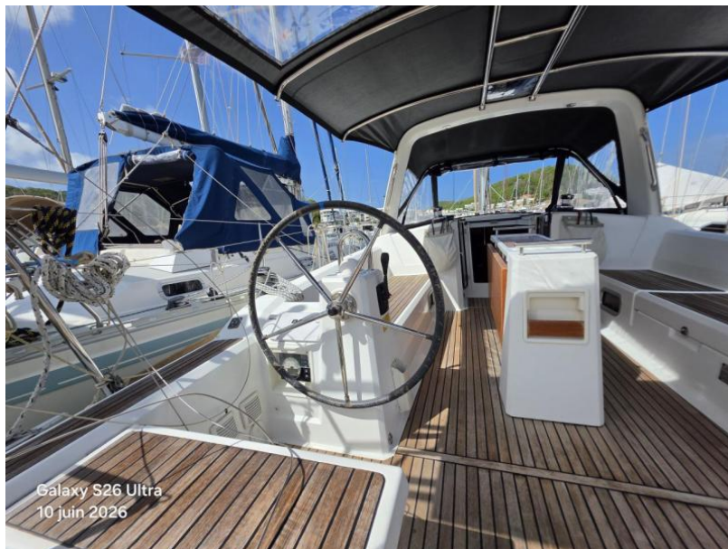
Galaxy S26 Ultra 10 juin 2026