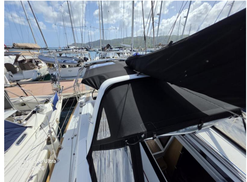
Galaxy S26 Ultra 10 juin 2026