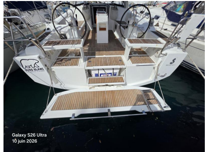
Galaxy S26 Ultra 10 juin 2026