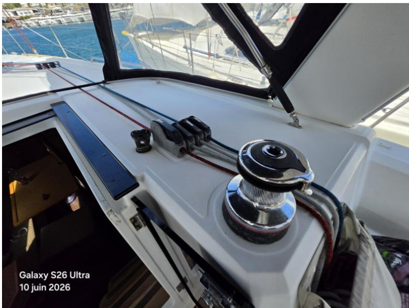
Galaxy S26 Ultra 10 juin 2026