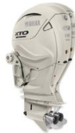
XTO Offshore® 450 TWIN