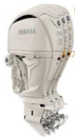
350 Yamaha Four-Stroke TRIPLE

Top Speed: 56.2 MPH @ 6100 RPM Optimum Cruise: 30.5 MPH @ 3600 RPM GPH at Optimum Cruise: 27.7 MPG at Optimum Cruise: 1.10