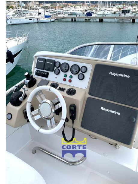
Azimut 64 Fly Layout: