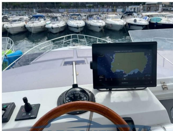
PLANCIA COMANDO FLY CON GPS GARMIN 12" NUOVO 2024 E NUOVA BUSSOLA