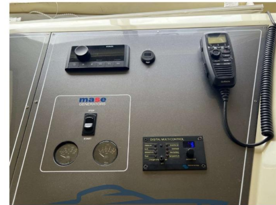
PANNELLO LATERALE CRUSCOTTO INTERNO NUOVO 2024 INTEGRATO CON COMANDI GENERATORE MASE 6,5 KW E PANNELLO CONTROLLO CARICABATTERIE INVERTER 2KW VICTRON NUOVO 2024