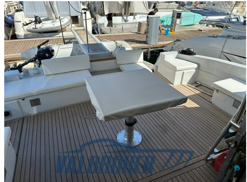
RAFFAELLI STORM S - REFITTING 2024