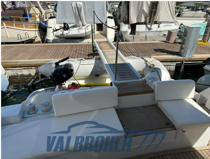
RAFFAELLI STORM S - REFITTING 2024