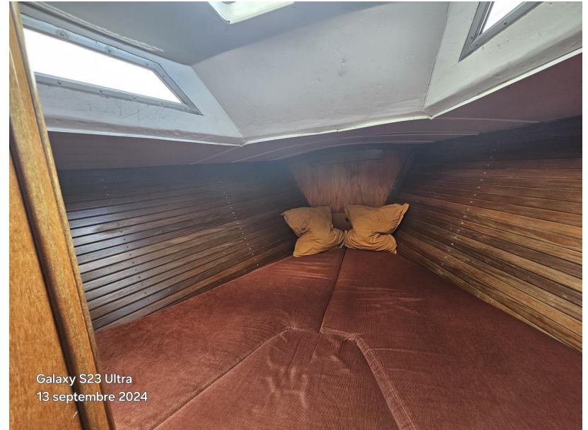
Galaxy S23 Ultra 13 septembre 2024