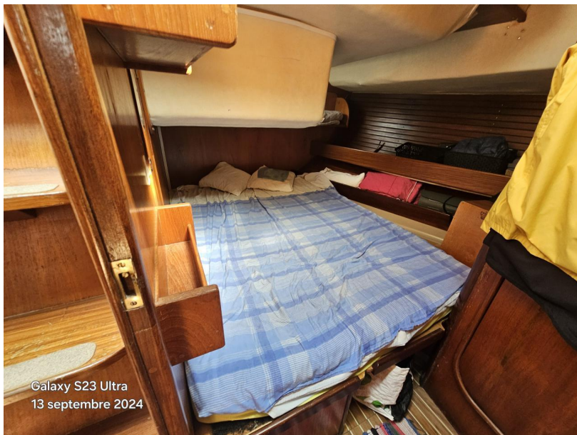
Galaxy S23 Ultra 13 septembre 2024