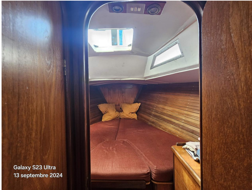
Galaxy S23 Ultra 13 septembre 2024