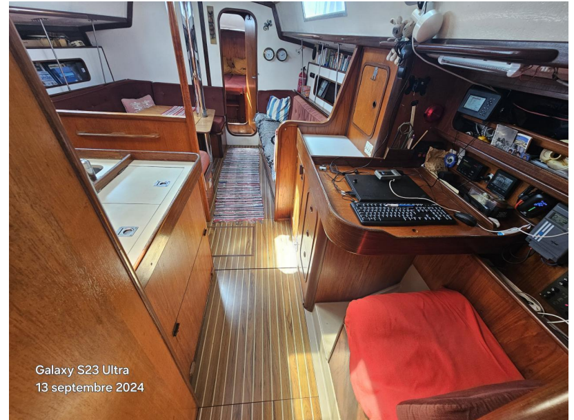
Galaxy S23 Ultra 13 septembre 2024