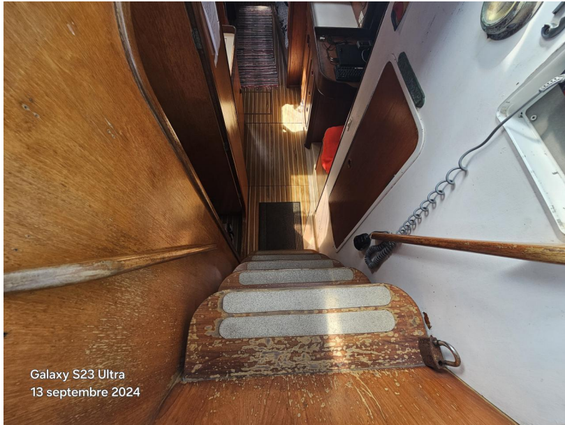
Galaxy S23 Ultra 13 septembre 2024