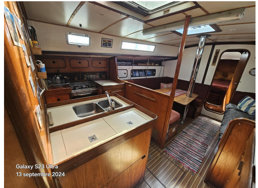
Galaxy S23 Ultra 13 septembre 2024