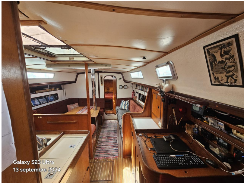
Galaxy S23 Ultra 13 septembre 2024