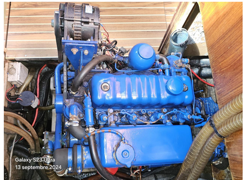
Galaxy S23 Ultra 13 septembre 2024