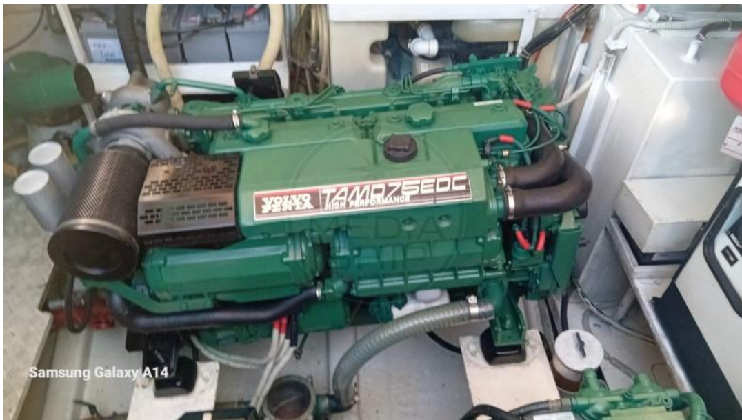
Samsung Galaxy A14