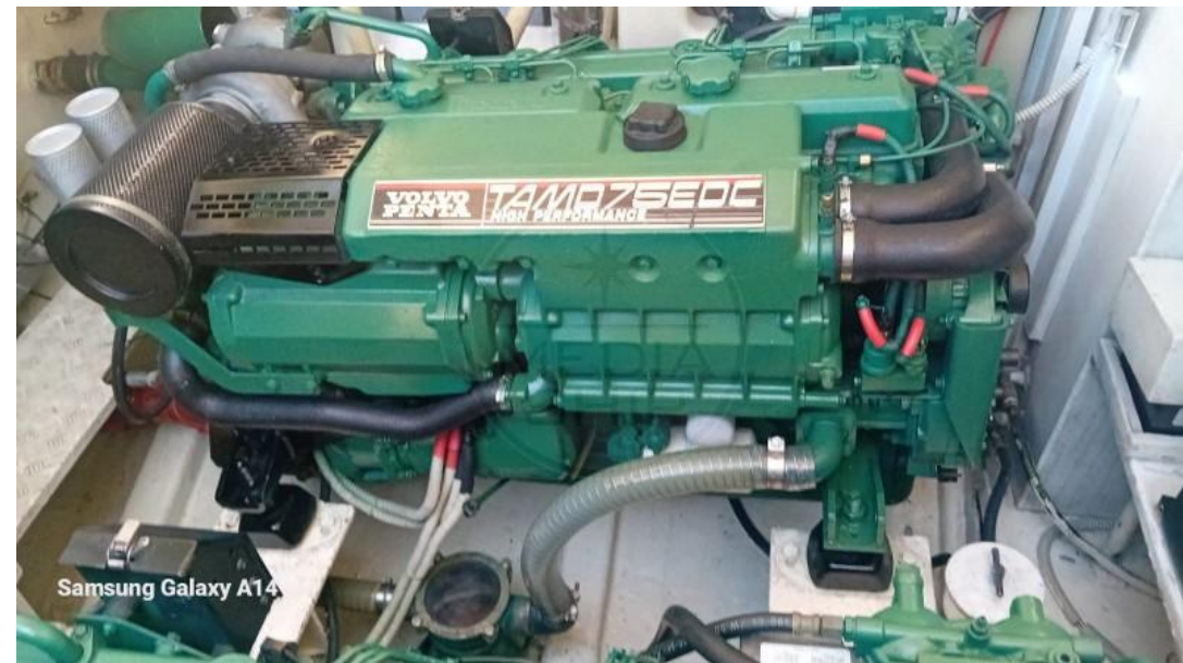
Samsung Galaxy A14