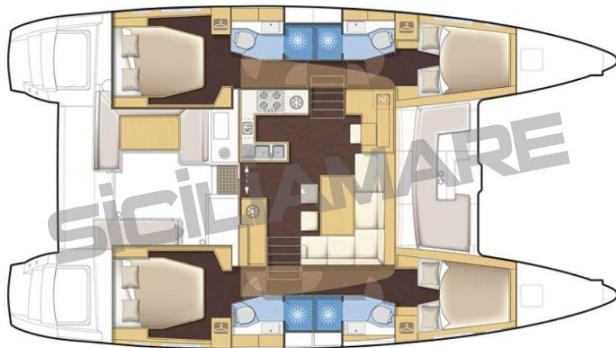
version 4 cabines / 4 cabins version