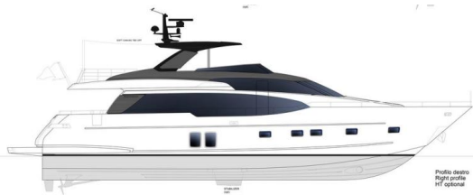
Profilo esterno Right profile RT optional