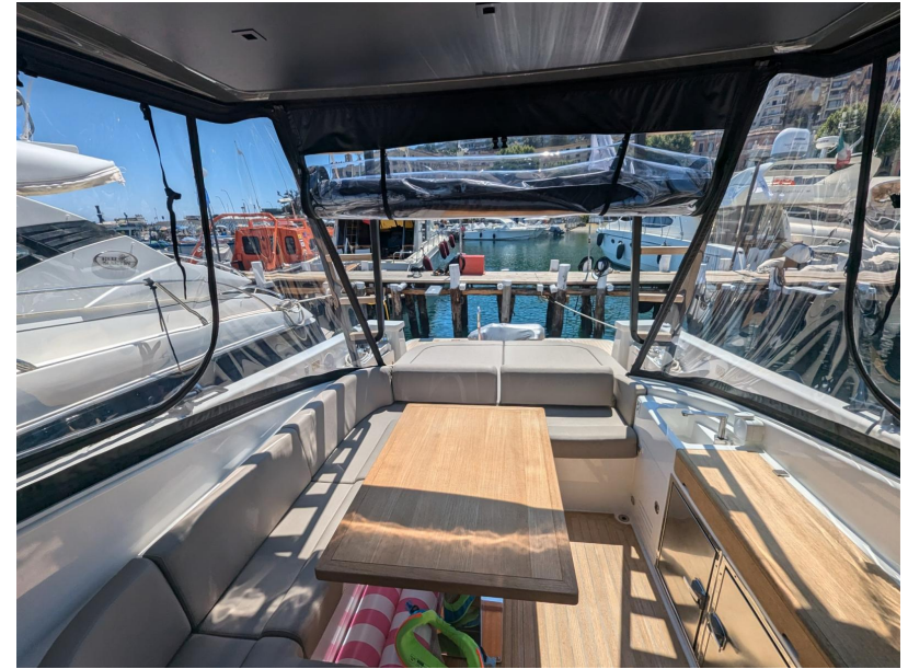
BG42 | 1 cabin, 1 bathroom -STD