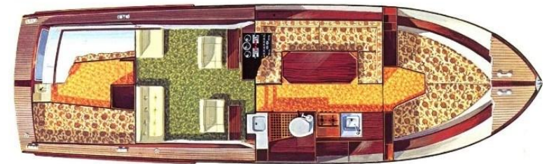
Storebro Royal Cruiser 34 - Layout del 1975